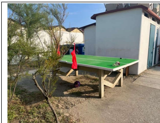
Children's play area